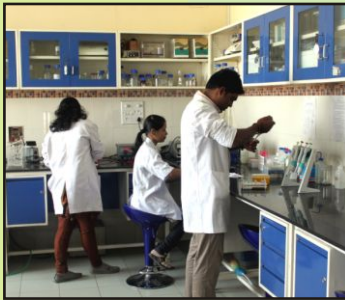
Upgradation and modernization of laboratories