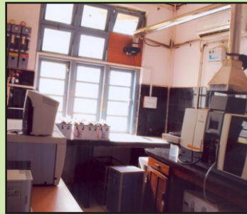
A renovated lab