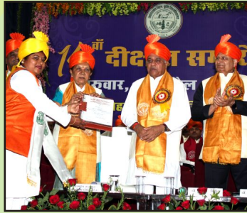
Convocation of the University Library equipped with books & journals