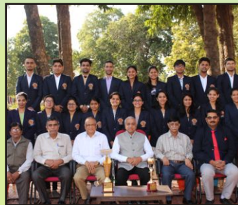
Students participation in extra curricular activities