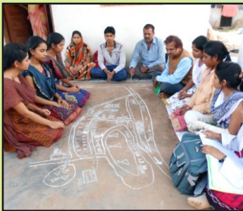
Practical oriented education (RAWE)