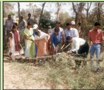
Forestry Work Experience (FWE)